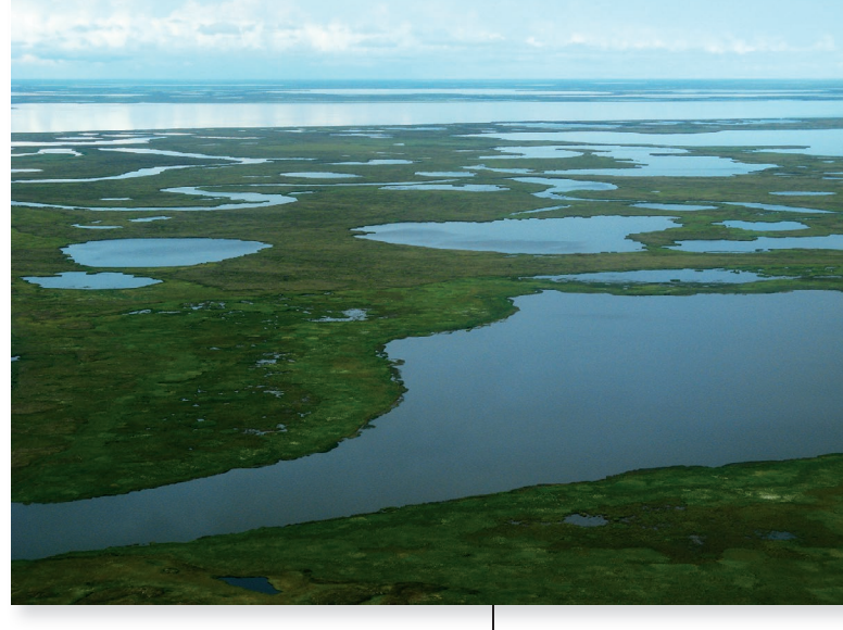
An Alaskan tundra landscape

Many different Native tribes lived in Alaska before the coming of European settlers. These tribes included the Aleuts, Eskimos, Athabascan, Haida, Tlingit, and Tsimishian tribes.