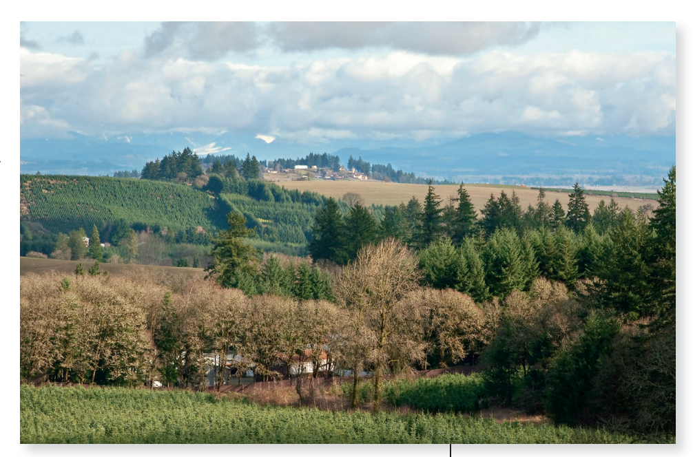
A view of the Willamette Valley

Oregon produces about one-tenth of the timber in the United States. This timber comes from the mammoth forests which cover the state. The geography of Oregon is quite varied and can be broken up into six regions. The region of the Columbia Plateau, which we have seen in several other states, is an arid grassland and lava plain that covers most of eastern Oregon. The Great Basin covers part of southeastern Oregon. Southwestern Oregon fea-