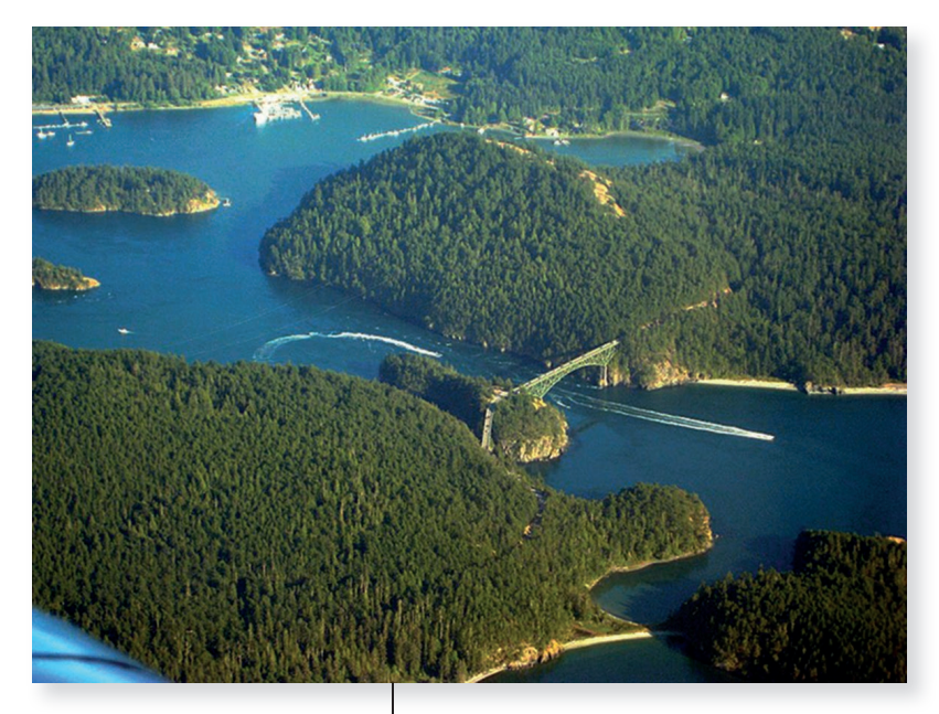
"Deception Pass" on Puget Sound

The Bannock, Cayuse, Chinook, Klamath, Modoc, Nez Percé, Paiute, Tillamook, and Umatilla native tribes were among the original inhabitants of the region.