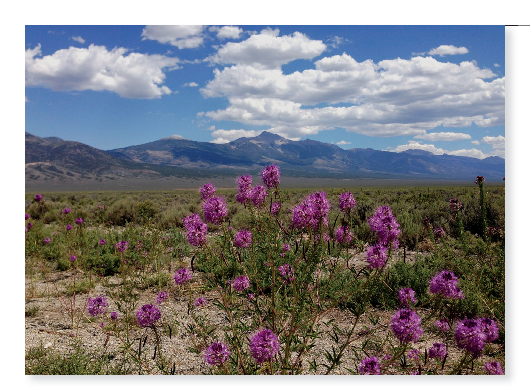
A view of Wheeler Peak in east-central Nevada as seen across an expanse of Great Basin desert